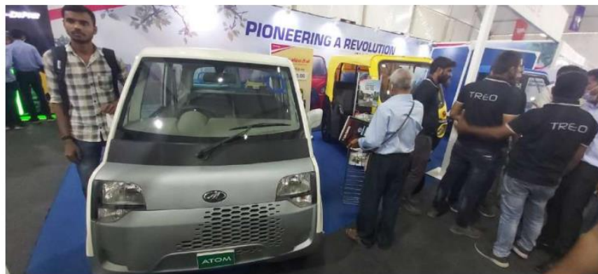
(Students visiting AFC Exhibition)