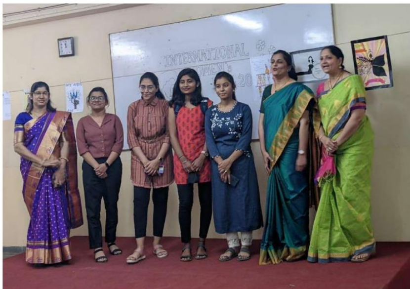
(Students, Faculty & Director of the Institute Photo Session)