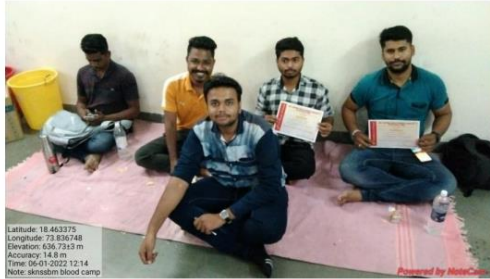
(Students donating blood and certificate Issuance)