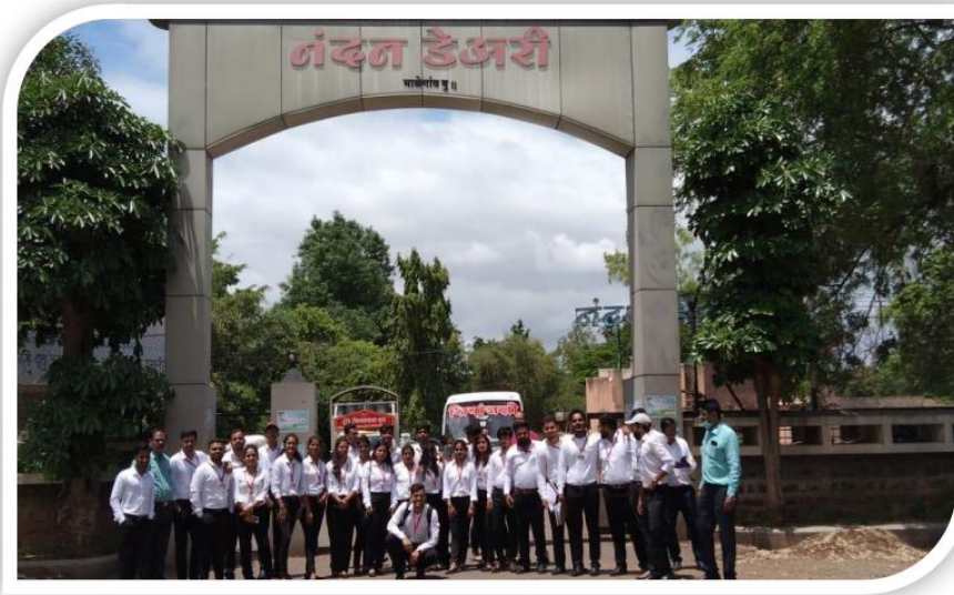
SKNSSBM, student at Nandan dairy