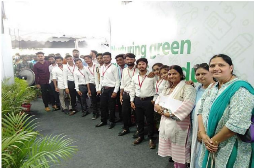
(Students & Faculty visiting AFC Exhibition)