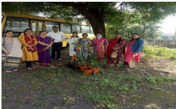
(Faculty & Director of the Institute- Tree Plantation Place)