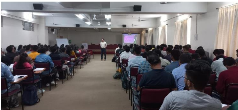
(Guest delivering lecture on Constitution)